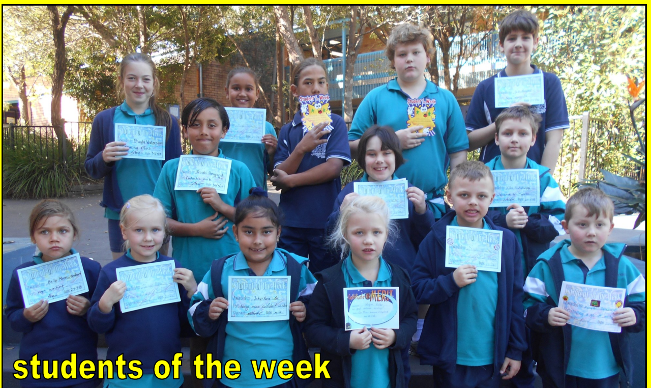
students of the week