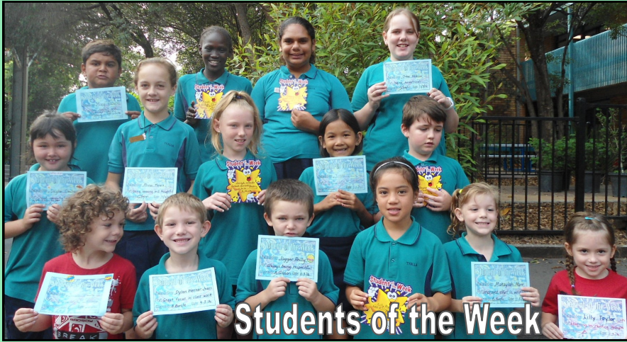
Students of the Week