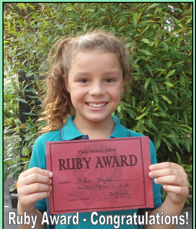
Ruby Award - Congratulations!

The more that you READ, the more THINGS you will know.