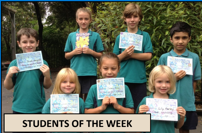
STUDENTS OF THE WEEK