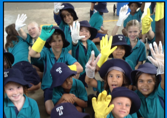
CLEAN UP AUSTRALIA!