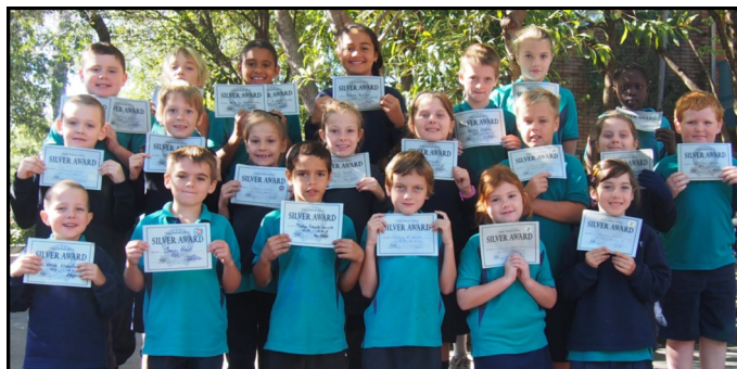
ABOVE & BELOW: SILVER AWARDS - CONGRATULATIONS!

Don't forget to visit the school website to see more photos of our fantastic student achievements!