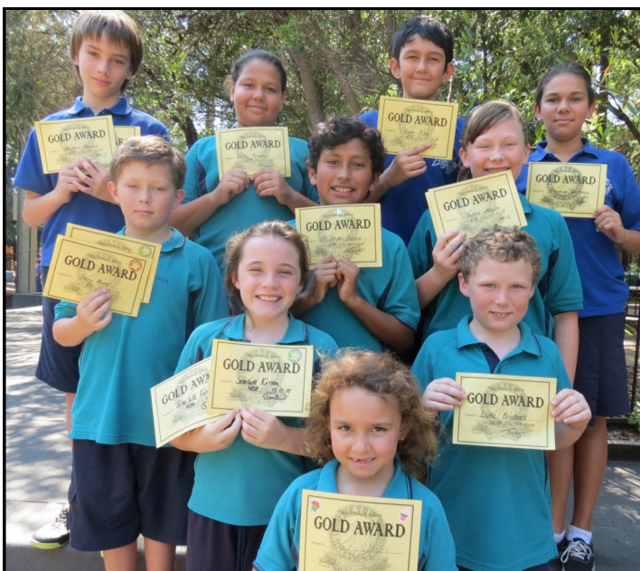
GOLD AWARDS ... FANTASTIC EFFORT