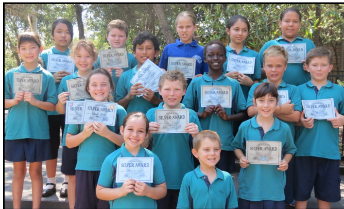
SILVER AWARDS ... WELL DONE