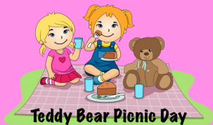
Teddy Bear Picnic Day